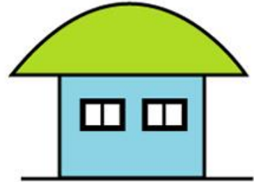
Free Form Roof